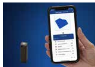
Measuring and testing devices by IST METZ