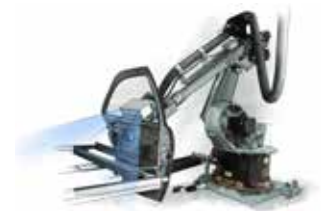
Coatings for two and three-dimensional parts