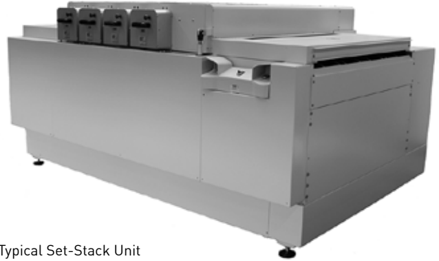
Typical Set-Stack Unit