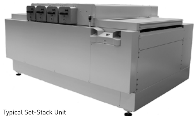
Typical Set-Stack Unit

Electrical lamp control (ELC ® ) for highest demands and best energy savings in UV printing