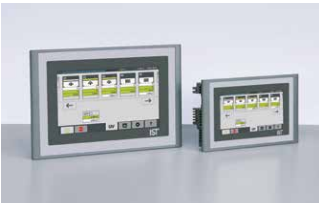
UV User Control Systems Smart Control