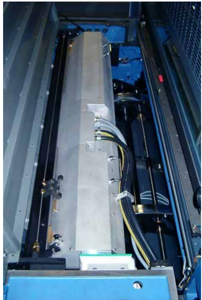
IST UV interdeck curing